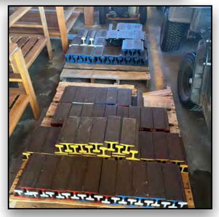
Tee Marker Painting