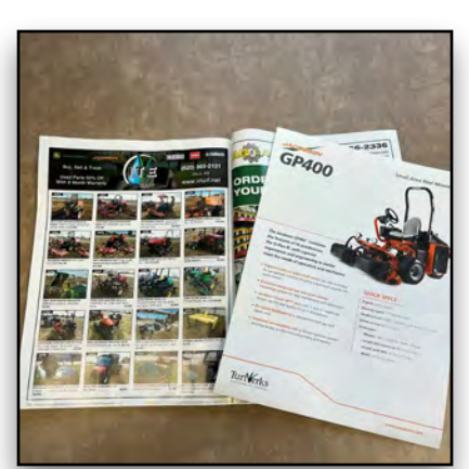
Equipment & Re-Alignment Ordering