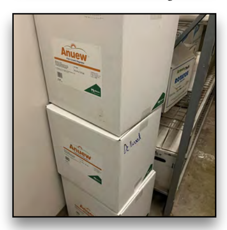
Fertilizer & Plant Protectant Orders