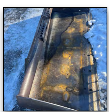
Loader Bucket Repair