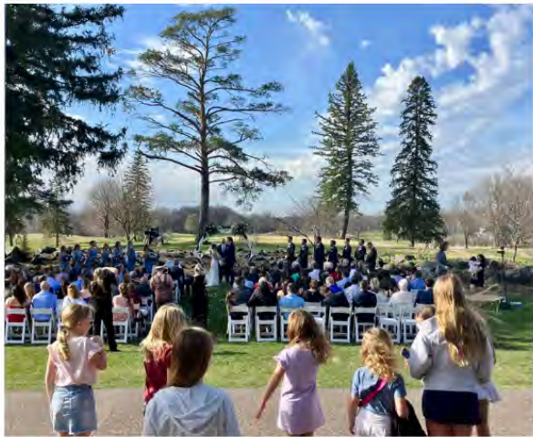
A group of young members watching the first outdoor ceremony of the year!